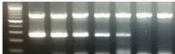
Fig. 1. Lane 1, 100 bp DNA ladder; lane 2, 10 pg M. pneumoniae DNA; lane 3, 1 pg M. pneumoniae DNA; lane 4, 100 fg M. pneumoniae DNA; lane 5, 10 fg M. pneumoniae DNA; lane 6, 1 fg M. pneumoniae DNA lane 7, 8, PCR reagent control (negative control)

When mycoplasma contamination exists, a band with around 250-270 bp appears. An internal DNA band with around 700 bp means the right performance of PCR reaction.